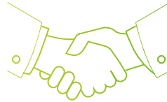
Sales and customer management